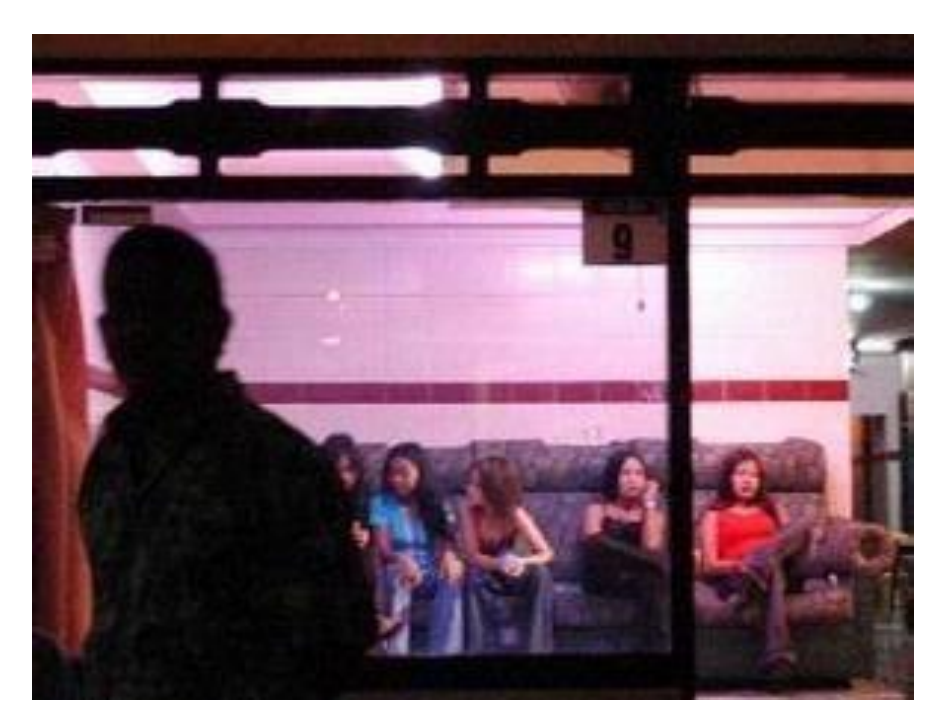
Figure 1 The atmosphere of a brothel in Dolly at operational hours

for many, not only for commercial sex workers, but also owners of stalls, cigarette vendors, parking attendants, motorcycle taxis, and becak drivers. This localization is the largest prostitution area in Southeast Asia even in Asia greater than Phat Pong in Bangkok, Thailand, and Geylang in Singapore. At least, statistics say more than 9000 prostitutes work in this area. The prostitutes come from Semarang, Kudus, Pati, Purwodadi, Nganjuk, Surabaya,Kalimantan and other regions in Indonesia. Even a small prostitute is an illegal immigrant from China and somesmall countries in the Middle East which are directly adjacent to the European continent. Nevertheless, the information is incorrect because there is no official comparative record between the Dolly region and the complex localization in other countries, such as the Phat Pong area in Bangkok, Thailand, and Geylang in Singapore. There has even been controversy because of the proposal to enter Gang Dolly as one of the tourist destinations of Surabaya for foreign tourists. Here is an overview of the Dolly area during operational hours, where prostitutes who are selling themselves "on display" in a glass-like room in front of the store.